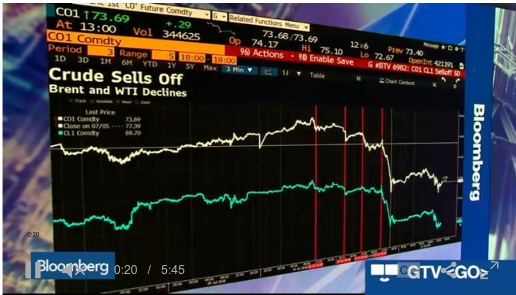
Trade War Sends Ripple Effects Through Oil Market